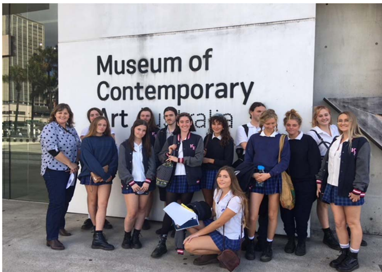
Year 12 Visual Arts 2019, at MCA.